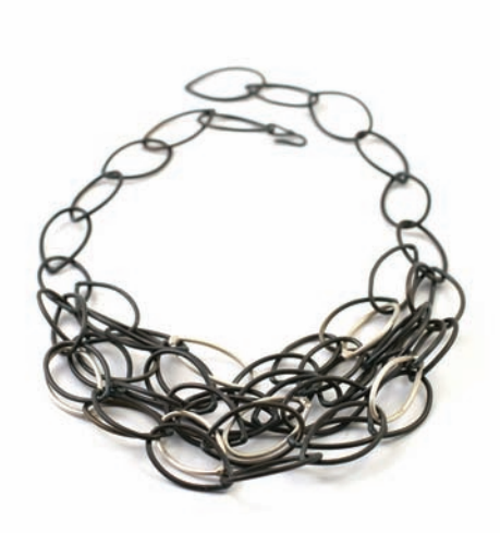
SL-N5-S MSRP - $250