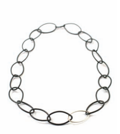
SL-N3-18 MSRP - $70

Every element in the collection is hand-formed and welded from steel wire and then given a soft, matte black finish that pops no matter what you're wearing. Throw in accents of sterling silver and you've got jewelry that's sure to make a statement, but durable enough to wear every day for years to come.