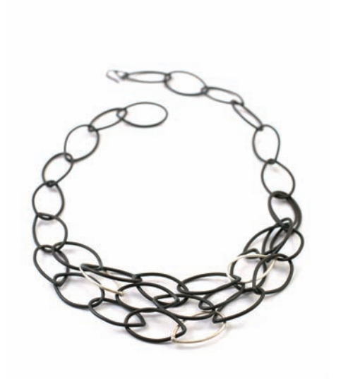
SL-N4-S MSRP - $180