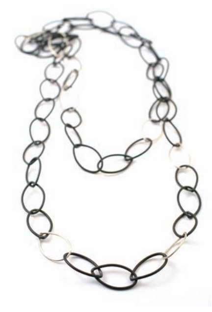
SL-N3-52 MSRP - $200