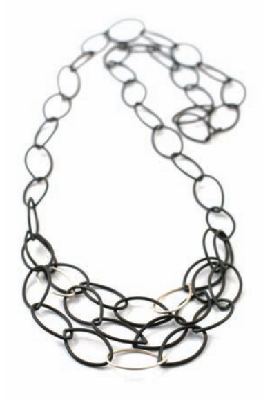
SL-N4 MSRP - $210