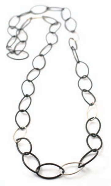
SL-N3-36 MSRP - $140