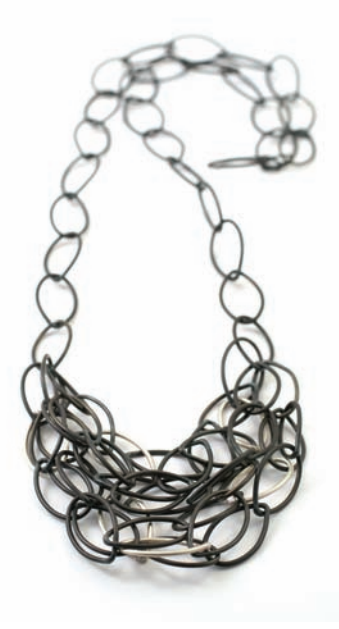
SL-N5 MSRP - $300